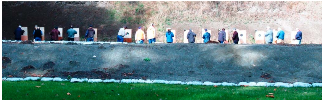
Sixteen competitors score their 50 yard slow-fire targets during the 45 stage of the pistol match held at Tacoma Rifle & Revolver Club on October 1, 2011. Byron Akita won the match, on a cool, but nice fall day.

For more detailed information: Please see the Pistol page of the WSRPA website for match programs, contact information, and directions to the ranges that sponsor the matches.