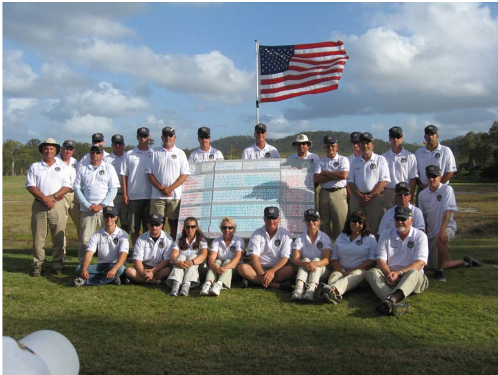
The 2011 USA Palma Team: Full report in January-February issue of the Primer

PRESORTED STANDARD U.S. POSTAGE PAID TACOMA, WA PERMIT NO. 1347