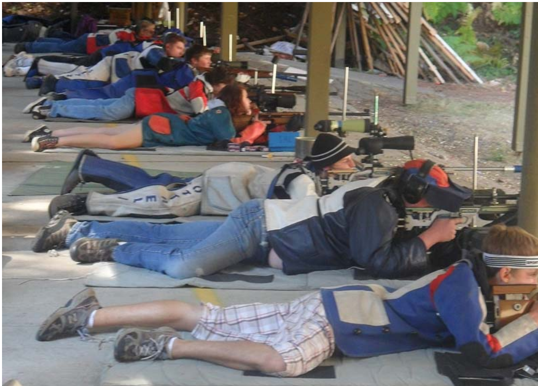
A view down the firing line during the Any-Sight Aggregate.