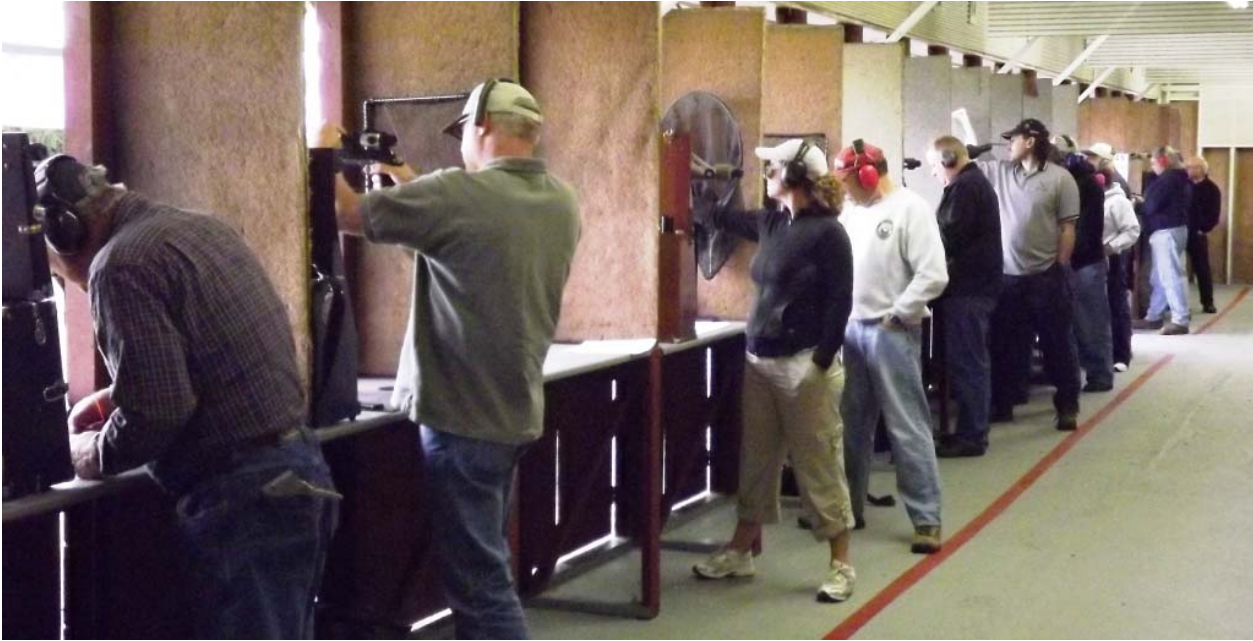
Sunday's relay prepares to shoot the center fire stage of the 2700 point State Championship.